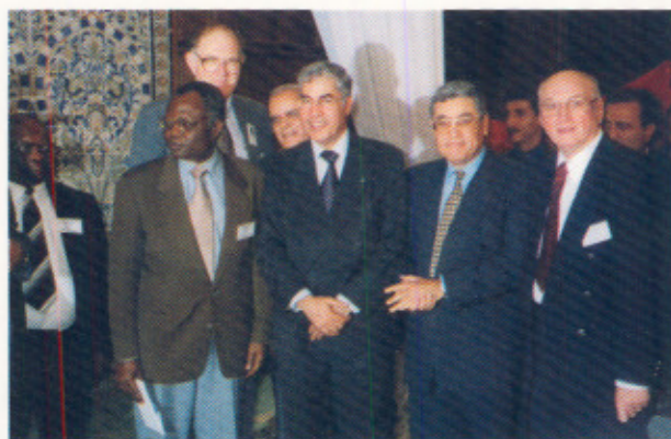
Pan African Mathematics Olympiads Symposium, November 2000