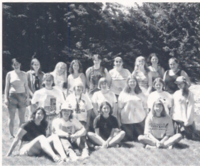
The 2000 All Girls/All Math Summer Camp.