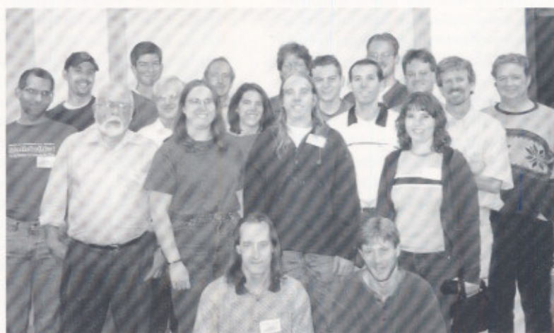
Participants of the Commutative Algebra and Algebraic Geometry special session of the Regional Workshop.