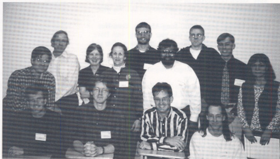
Pictured above are some of the participants in the commutative algebra session of the Regional Workshop in Mathematics.

The two other research conferences have yet to take place as we go to press. The Workshop in Mathematics and the Geosciences is part of a special semester-long program in applied mathematics focusing on problems in hydrogeology. It is