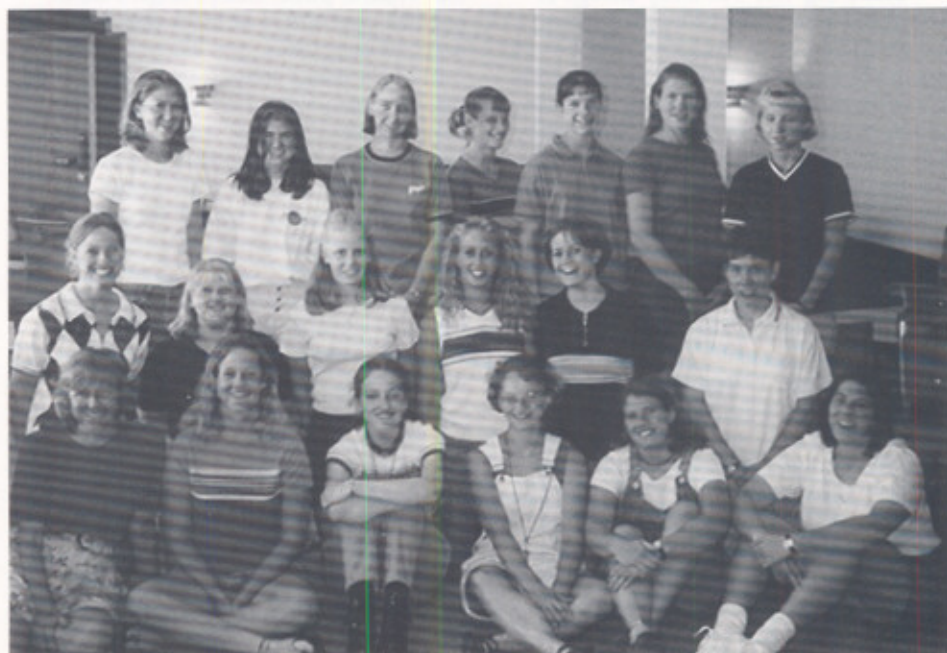
Participants in the All Girls/All Math Summer Camp

The Nebraska Math and Science Initiative was instrumental in planning and providing technical support for the program. Financial support came from the Nebraska Math and Science Initiative, the Math and Science Education College Area of Strength, the University of Nebraska and the Department of Mathematics and Statistics.