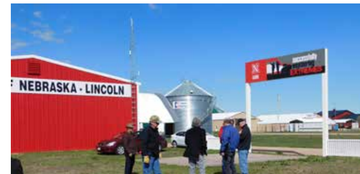
Early spring planning for this year’s UNL Extension and IANR Husker Harvest Days displays near Grand Island. The show is in September.

Detail planning for both these events is just getting underway, but the symposium will be centered on presentations and panel discussions centered on the Upper and Lower Platte River basins, as well as the Republican, Blue and Niobrara Rivers. As always, the law conference will focus on the latest in Nebraska water law, primarily for water professionals and practicing attorneys.