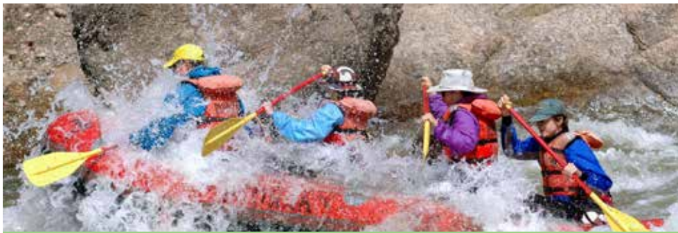
The summer water and natural resources tour will spend part of an afternoon rafting in Colorado's high country.

The annual water and natural resources tour, hosted by the University of Nebraska's Nebraska Water Center (NWC) and The Central Nebraska Public Power and Irrigation District (CNPPID), will visit Colorado this summer.