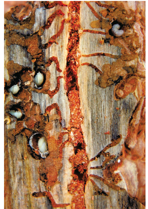
Figure 8: Characteristic tunnels (galleries) of mountain pine beetle made by the adults and larvae. The underbark area looks like this in late spring. Blue-stained wood is caused by fungi the beetles introduce.