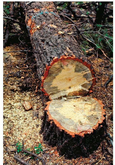
Figure 9: Cut tree killed by MPB, showing the characteristic blue-staining pattern.