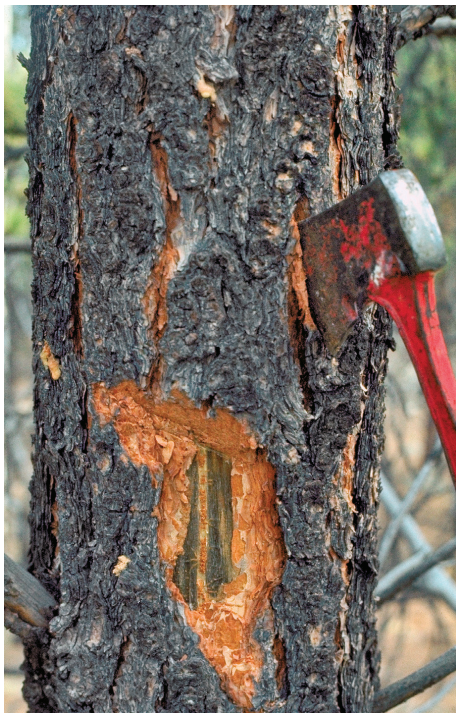
Figure 7: Checking beneath the bark for MPB. This attack was successful (note tunnels and stain).

One very effective way to kill larvae developing under the bark (though very