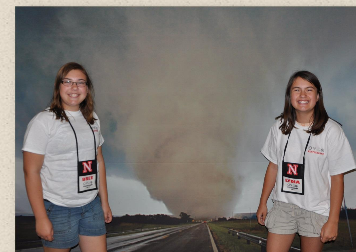
Tornado! In front of our tornado mural