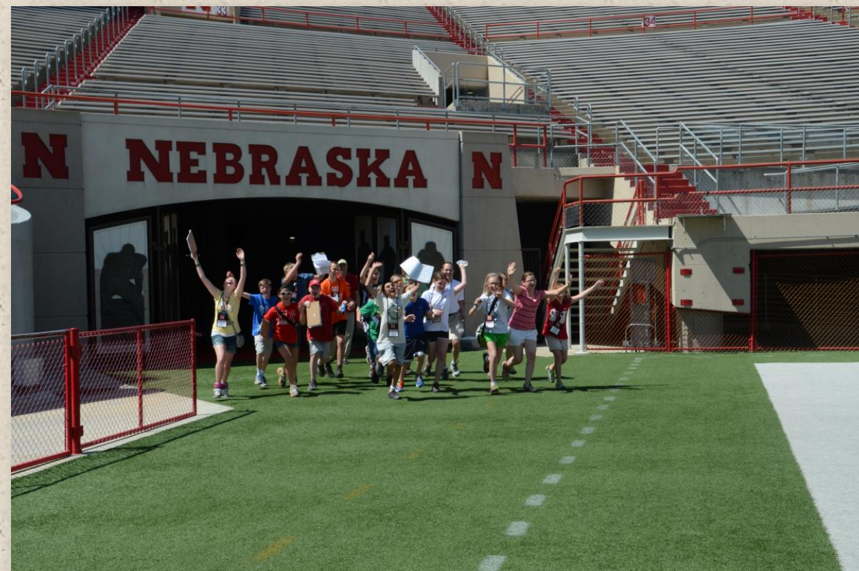
Weather Campers arrive at Memorial Stadium to conduct a micro climate study of the stadium

UNL Weather Camp Website: http://go.unl.edu/weathercamp The above link has a slide show of previous UNL Weather Camp activities.