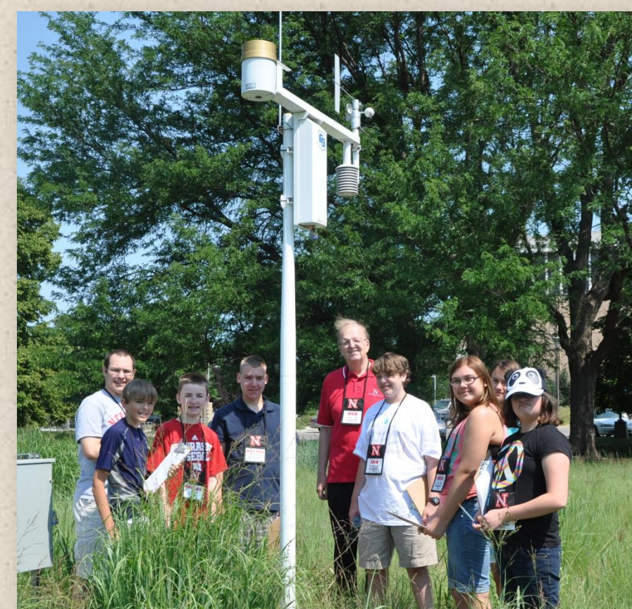
Exploring our automated weather station