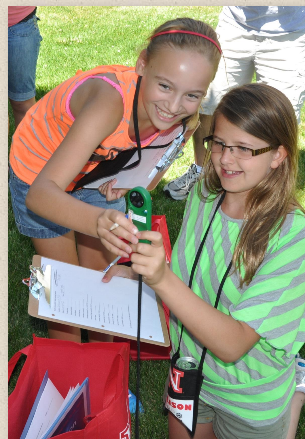
Daily weather observations