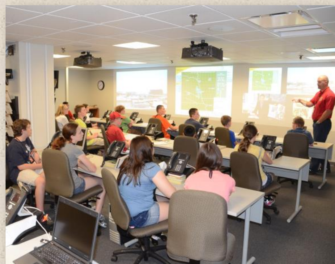
At the Emergency Command Center