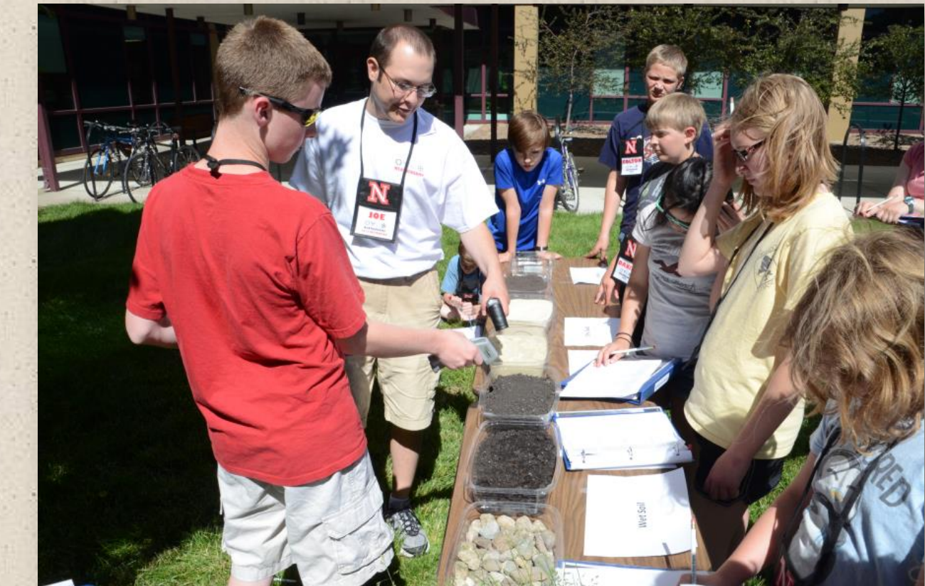
Using instruments to conduct experiments outdoors

June 9-13, 2014 Monday - Friday (9am-5pm) Friday: Family picnic, 5-7pm