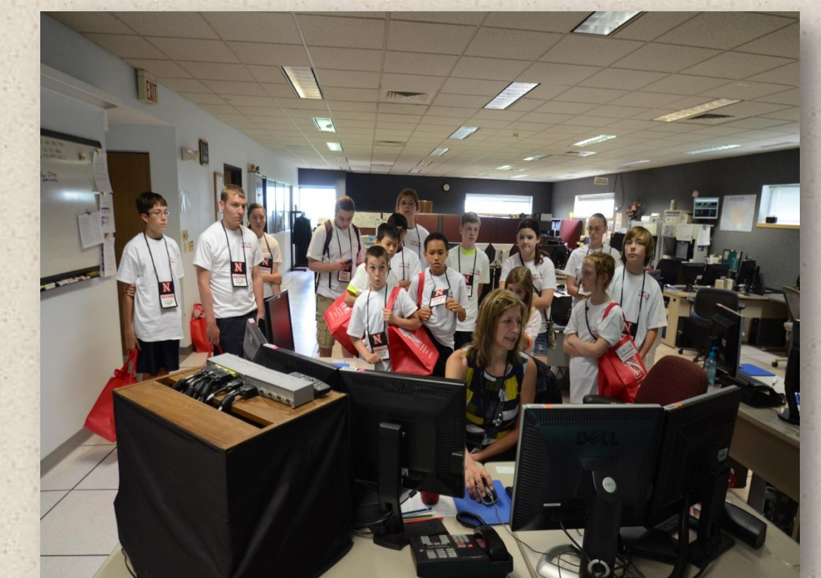
At the National Weather Service Forecast Office