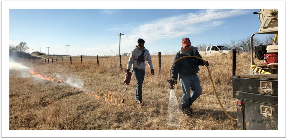
Prescribed burn association (PBA) members torching and wet lining for a prescribed burn.

If you travel across Nebraska and the great plains on any given day during the spring you may have noticed an ever increasing amount of smoke plumes popping up on landscape over the past decade or more. While we have seen our share of wildfires over the years, a vast majority of these are the result of prescribed burns. These carefully planned and managed fires are vital to restoring and maintaining our grasslands, wetlands, and woodland ecosystems and in return they help us maintain our natural and agricultural heritage dependent upon them. You may love the sights and sounds of our state bird, the meadowlark, but did you know that grassland birds declined nearly 60% over the years with a major cause due to woody plant encroachment from eastern redcedar trees that are easily controlled by fire? Or, did you know that these trees also threaten our livestock industry by taking away valuable grazing lands?