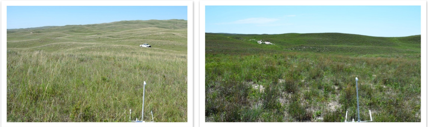
Figure 2. Photo points of two central sandhills SRMC monitoring transects. Left: 9% bare ground calculated along this transect. Right: 42% bare ground calculated along this transect.

Overall results from SRMC ranches showed variability in plant community and ground cover across the different monitoring sites as well as differences by Sandhills region (Figure 2.). All SRMC data is combined by region and presented on our webpage ( https://spark.adobe.com/page/EkDaaEdOVwCXG/ ). Monitoring will be repeated, and more ranches added in 2021. Future analysis will link ranch management data with plant community and soil health.