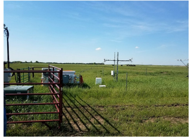
The LTAR field with brome-dominated vegetation on continuous grazing

This project was funded by the Arthur W. Sampson Fellowship Fund, University of Nebraska-Lincoln, and the McIntire-Stennis Fund.