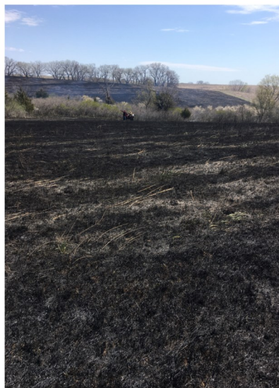
Dalbey Prairie after a prescribed burn.