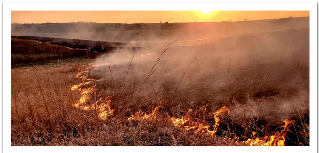
A sunset prescribed burn.

Realizing the benefits of using fire to manage grassland may inspire you to start your own prescribed burn association or to join an existing association in your area. The future of our cherished Great Plains ecosystem is in the hands of these great stewards of our lands and fire needs to be a part of that stewardship. For more information on prescribed fire and prescribed burn associations you can contact any private lands wildlife biologists within Pheasants Forever and we can get you in contact with a local PBA or help you start one. Visit NebraskaPF.com for more information.