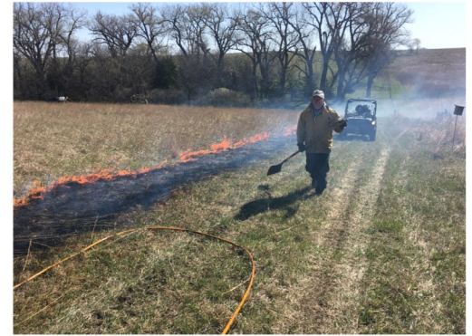
Sam Cowan, Nebraska Game and Parks Commission, works a prescribed burn at Dalbey Prairie.

Dave worked with a team of grassland fire specialists from the Nebraska Game and Parks Commission and UNL in conducting a prescribed fire on 90 acres of the Dalbey Prairie on April 14, 2021. Dalbey Prairie is a 135-acre property south of Virginia, Nebraska. The purposes of the fire were to control exotic, cool-season grasses, and woody plants (e.g., eastern redcedar), to remove the accumulation of dead plant material, and to encourage growth of the native plants in the prairie. (Continued on Page 3)