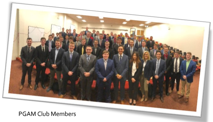
PGAM Club Members

This has grown into a very popular event over the years. Those interested in registering a team or becoming a sponsor are encouraged to call the PGAM office at (402) 472-7467. A student leader will be happy to discuss participation or sponsorship opportunities with you.