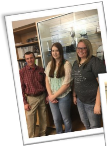
PGAM Graduates and Guests