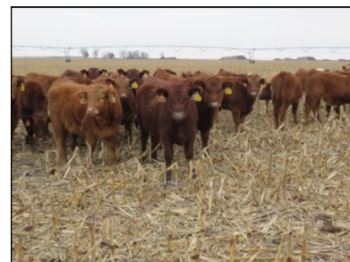
Cattle grazing corn residue.

The best evidence is provided by a sixteen-year study of corn residue grazing in eastern Nebraska. In this study grazing did not result in detrimental effects on soil properties (including bulk density and penetration resistance) or crop yields. These fields were silt-clay-loam soil and were managed under no-till in corn-soybean rotation. Grazing of corn residue improved soybean yields by 3.4 bu/ac with fall (November to February) grazing. An increase in the soil microbial community was observed (when compared to areas that were not grazed). The effects on the soil microbial community may explain the improvement in soybean yields because an increase in soil microbes (actinomycete bacteria and saprophytic fungi) may increase the rate of nutrient cycling. Another concern is that grazing may reduce soil OM (due to residue removal) or result in the export of nutrients such as N, P and K. After sixteen years of grazing, no differences in soil organic matter, N, P or K were measured. It is important to remember that most of the nutrients (such as N, P, K, Ca, etc.) consumed by cattle are excreted back on to the land.