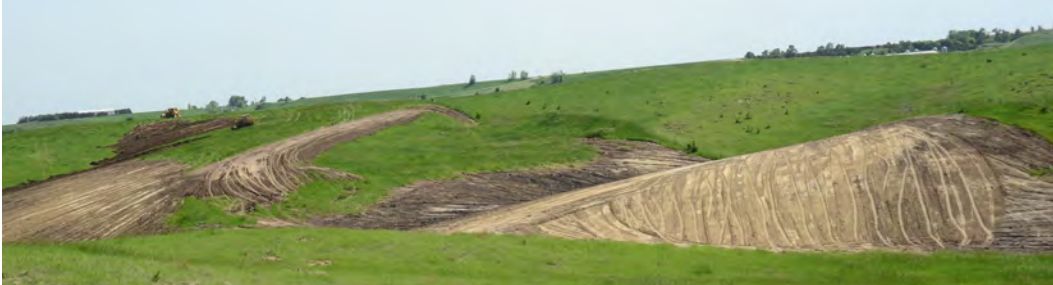
The pace at which native grasslands are being converted to crop production is happening at an alarming rate. In 2012, Nebraska led the nation in having 54,876 of "non-cropland converted to cropland" according to the US Department of Agriculture data.