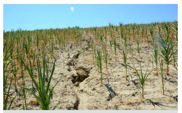
Fields like this one that were native grassland in 2011 and converted to crop production in 2012 are often done so with little regard to the field's ability to actually produce crops. The economic incentives offered from federal crop insurance typically provide a guarantee of financial profit regardless of crop production.

susceptible to higher rates of soil erosion, degraded water quality and increased chemicals in water sources.