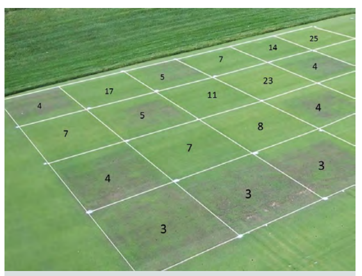
Figure 2. The effect of Mehlich-3 soil test phosphorus level (ppm) on a creeping bentgrass golf putting green. Phosphorus deficiency was easily confused with severe drought. Soil test phosphorus levels of 7 ppm or greater had equal turfgrass quality.

ultimately determine how much soil test phosphorus is required to grow healthy golf turf.