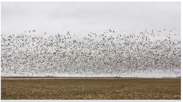
Approximately 8 million ducks and millions of geese stop over in the Rainwater Basin each spring.

But the WRP grazing option is just one way to make the transition from marginal cropland — or idled wetland — to pasture. Through the Working Lands Initiative, RWBJV partners can help landowners in a number of ways. The partnership provides assistance to seed the tract with native grasses and restore the wetland, if necessary. Partners provide cost-share assistance for