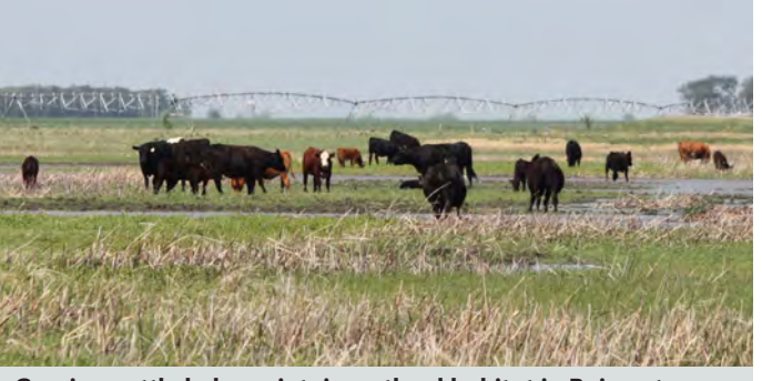
Grazing cattle help maintain wetland habitat in Rainwater Basin wetlands.