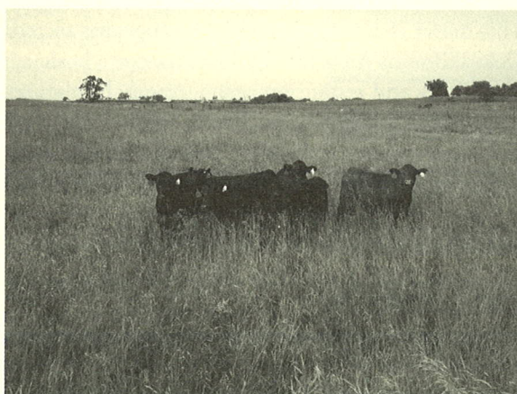
Yearling cattle grazing smooth brome grass pasture at Mead, NE