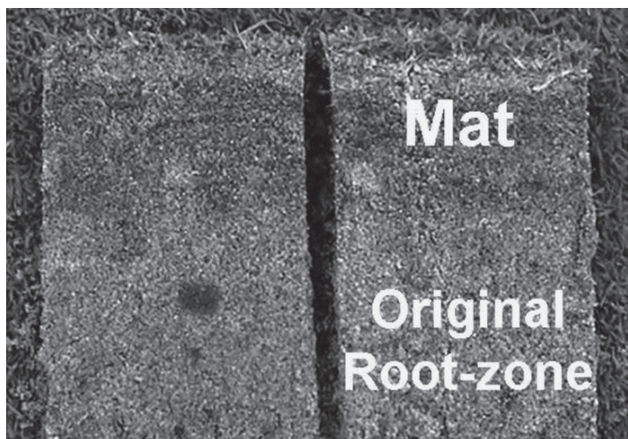
Mat region and original root-zone in profiles taken from 8-year old USGA 80:15:5 (sand:peat:soil) green collected 15 June 2004 at the JSA Turfgrass Research Facility near Mead, NE. While a transition between mat and original root-zone is evident, individual layering and a distinct grow-in layer it not.

During the grow-in year, all but four of the chemical properties investigated were significantly greater for the accelerated establishment treatment (ET) when compared to the controlled ET. Boron, organic matter, and sodium were also higher in the accelerated ET, but these differences were not significant. Only pH was lower in the accelerated ET during the grow-in year. This was likely caused by an acidification effect from increased fertilizer inputs containing ammonium-nitrogen and sulfur, both known to lower soil pH.