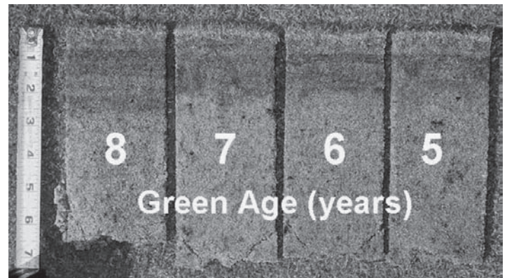
Profiles taken from USGA 80:20 (sand:peat) greens collected 15 June 2004 at the JSA Turfgrass Research Facility near Mead, NE. Once established, formation of amt is increasing approximately 6.5 mm (0.25”) annually and ranges from 5cm (2”) to 7cm (2.75”) for 5-year and 8-year greens, respectively.

Research was conducted at the University of Nebraska John Seaton Anderson Turfgrass Research Facility near Mead, NE. Four experimental greens were constructed following USGA specifications in sequential years from 1997 to 2000. Treatments included two rootzones – 80:20 (v:v) sand and sphagnum peat and an 80:15:5 (v:v:v) sand, sphagnum peat, and soil (silty clay loam), and two establishment grow-in programs – accelerated and controlled. Establishment treatments were based on recommendations gathered by surveying golf course superintendents and a USGA agronomist with experience in establishing putting greens. The accelerated establishment treatment included high nutrient inputs and was intended to speed, or decrease time for, turfgrass cover development and readiness for play. The controlled establishment treatment was based on agronomically sound turfgrass nutrition requirements. Plots were seeded with “Providence” creeping bentgrass ( Agrostis stolonifera Huds.) at 1.5 lbs per 1000 ft 2 . During the establishment year, the total amount of N, P, and K of the accelerated establishment treatment was two times and four times the amount of the controlled establishment treatment for pre-plant and post-plant, respectively.