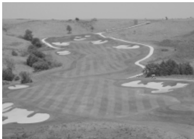
This golf course uses bentgrass, one of the grasses on which genetic research is currently being conducted.