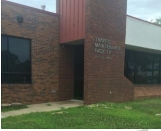
Traffic Maintenance Facility

I also met a lot of people at the Traffic Maintenance Facility where some of the city's maintenance