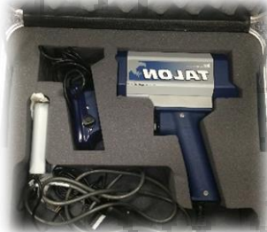
Talon Radar Gun

Speed limits and speed bumps are some items involved in traffic calming. I worked a lot with traffic calming devices. I regularly had a few tube counters laid out across different streets all around the city. The tube counters record the number of vehicles traveling on that street and their exact speed. A radar gun was provided for my use at times where speed studies were needed. I recorded the speeds of 100 cars traveling both ways on 2-way streets around the city. The data collected from the tube counters and speed studies helped to find the 85 th percentile speed. This speed is used to determine if it would be necessary to install a speed bump.