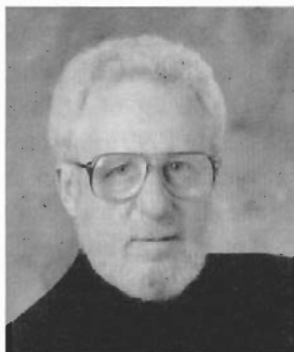
Alan J. Heeger

Alan J. Heeger (B.S. 1957) was awarded a Doctor of Science degree at the August 1999 UNL graduation ceremonies. Heeger is a professor in the physics department at the University of California - Santa Barbara, where he serves as the Director of the Institute for Polymers and Organic Solids. Heeger has a distinguished record of accomplishments and awards for his research in condensed matter physics. His most recent work has focused on understanding the nature of polymers.