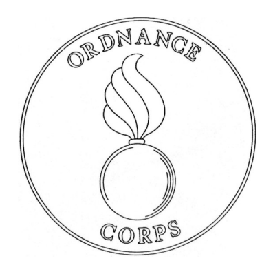
Ordnance Corps . The plaque design has the branch insignia, letters, and rim in gold. The background is crimson.