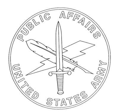
Public Affairs. The plaque design has the Public Affairs collar insignia, letters, and rim in gold. The background is teal blue.