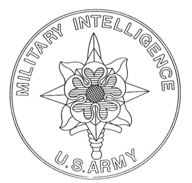
Military Intelligence . The plaque design has the branch insignia proper (gold with dark blue rose). The letters are dark blue, background is white and rim is gold.