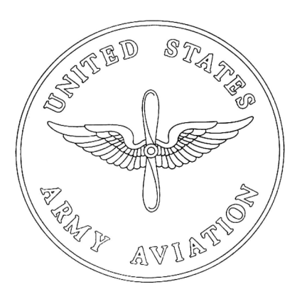
Aviation . The plaque design has the branch insignia in proper colors (gold wings with silver propeller). The letters are golden orange and the rim is gold. The background is ultramarine blue.