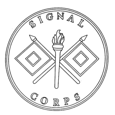
Signal Corps. The plaque design has the branch insignia proper (red, white, and gold) with gold letters. The outer rim is gold with a narrow band of orange. The background is white.