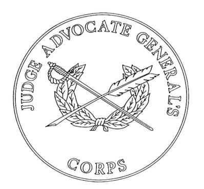
Judge Advocate General's Corps . The plaque design has the branch' insignia, letters, and rim in gold. The background is dark blue.