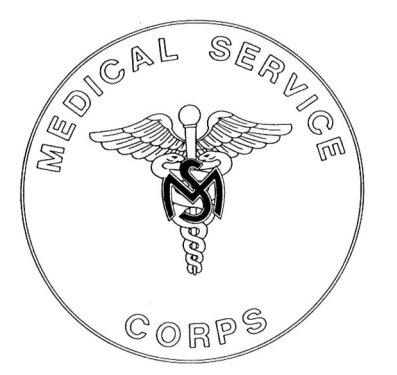
Medical Services Corps . The plaque design has the branch insignia in silver with the letters "MS" in black, outlined with silver. The letters and rim are silver.