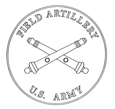
Field Artillery . The plaque design has the branch Insignia, letters, and rim in gold. The background is scarlet.