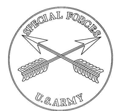
Special Forces. The plaque design has the branch insignia, letters, and rim in gold. The background is jungle green.