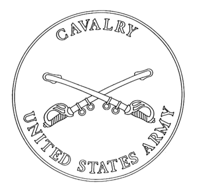
Cavalry . The plaque design has the Cavalry insignia and borders gold. The background is white and the letters are scarlet.