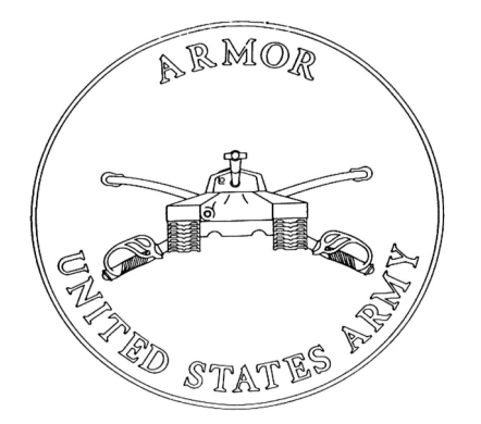
Armor . The plaque design has the branch insignia, letters, and border in gold. The background is green.