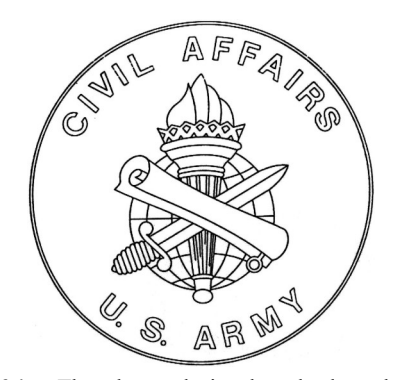
Civil Affairs. The plague design has the branch insignia, letters, and border in white and the background is purple.