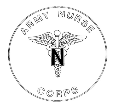
Army Nurse Corps. The plaque design has the branch insignia in gold with the letter "N" in black, outlined with gold. The letters and rim are gold and the background is maroon.