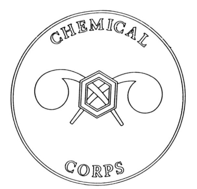
Chemical Corps . The plaque design has the branch insignia in gold with the benzine ring in cobalt blue, outlined in gold. The letters and border are gold and the background is cobalt blue.