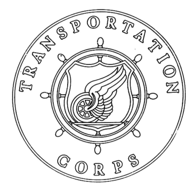
Transportation Corps. The plaque design has the branch insignia, letters, and rim in gold. The background is brick red.