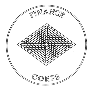
Finance Corps . The plaque design has the branch insignia, letters, and rim in gold. The background is silver gray.