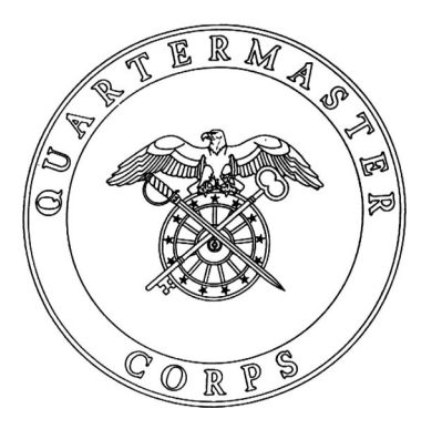
Quartermaster Corps. The plaque design has the branch insignia proper (gold with ring of wheel in blue, stars and inner hub in white, and hub pin in red). The designation band is blue, the letters and borders are gold, and the background is buff.