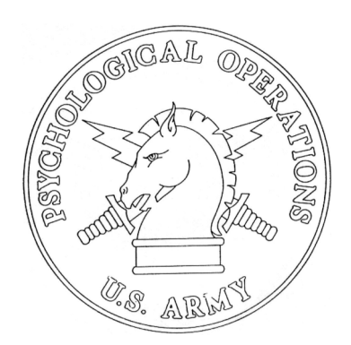
Psychological Operations . The plaque design has the Psychological Operations collar insignia, letters, and rim in gold. The background is bottle green.