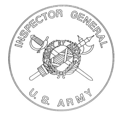
Inspector General. The plaque design has the Inspector General insignia, letters, and rim in gold. The motto lettering and background are dark blue.