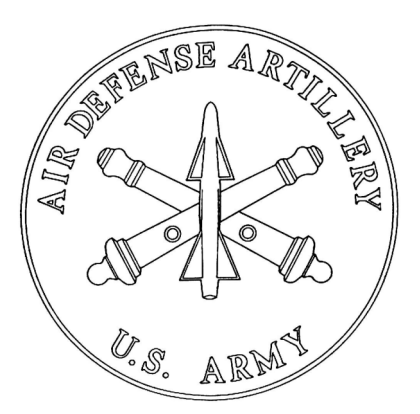
Air Defense Artillery . The plaque design has the branch insignia, letters, and border in gold. The background is scarlet.