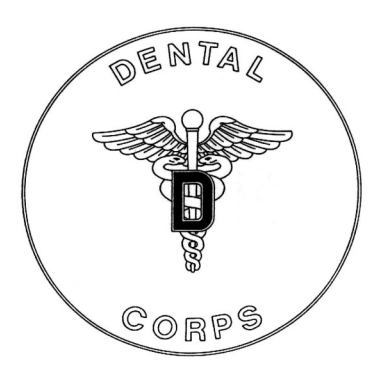
Dental Corps . The plaque design has the branch insignia in gold with the letter "D' in black, outlined with gold. The letters and rim are gold and the background is maroon.