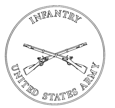
Infantry . The plaque design has the branch insignia, letters, and rim in gold. The background is light blue.