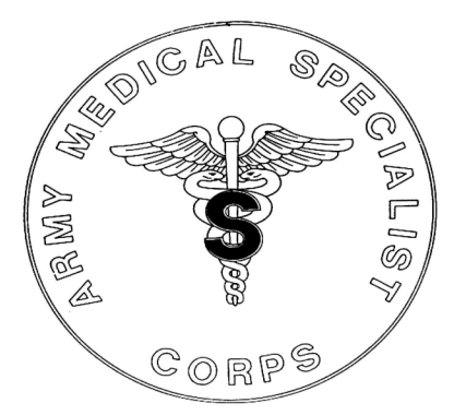
Army Medical Specialist Corps . The plaque design has the branch insignia in gold with the letter "S" in black, outlined with gold. The letters and rim are gold and the background is maroon.