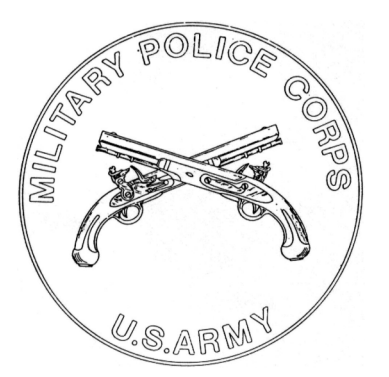
Military Police . The plaque design has the branch insignia, letters, and rim in gold. The background is green.