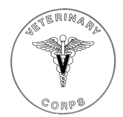
Veterinary Corps. The plaque design has the branch insignia in gold with the letter "V" in black, outlined with gold. The letters and rim are gold and the background is maroon.