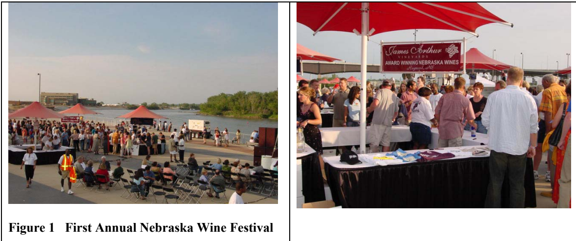
Figure 1 First Annual Nebraska Wine Festival

Competition and the Tasters Guild International Wine Competition. We're also excited about one of our newest releases Heartland White, which most recently earned a silver at the Los Angeles County Fair. Check out our awards section for all the other JAV winners of late.