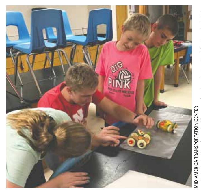
Building race cars made of food and powered by potential energy stored in a rubber band is one of the hands-on, inquiry-based activities in the Roads, Rails, and Race Cars after-school program, held in schools around Nebraska.

During the design phase, "we looked at car designs: what made cars faster and more aerodynamic," he reports. "There was a relationship between what we discussed and building