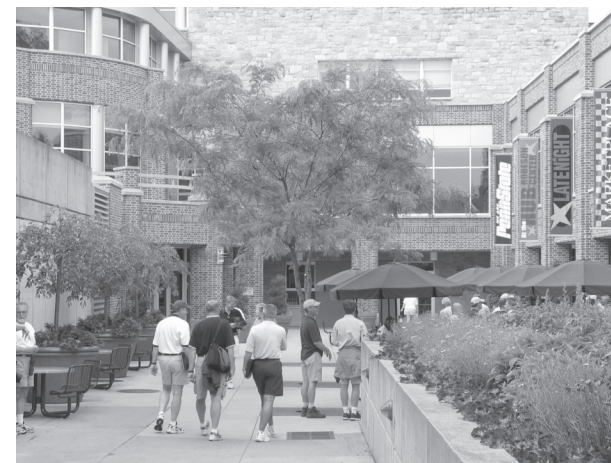
2004 MLAGM at Penn State University

It will be a busy spring, but we believe UNL is one of the finest campuses in the Big 10 and we're excited to show it off to our colleagues.